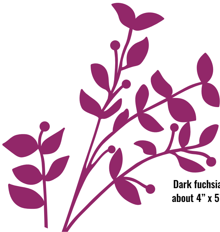
Dark fuchsia about 4" x 5"