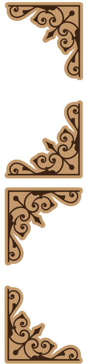
Gold about 1.5" x 4"